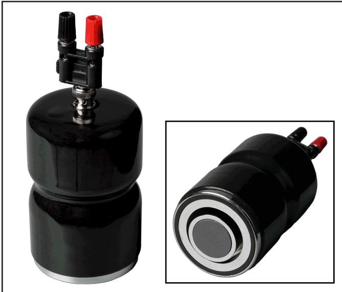
Figure 1. Desco 50005 Concentric Ring Probe