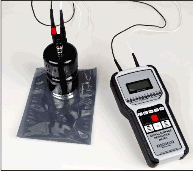
Figure 2. Using the Concentric Ring Probe with the Desco Digital Surface Resistance Meter