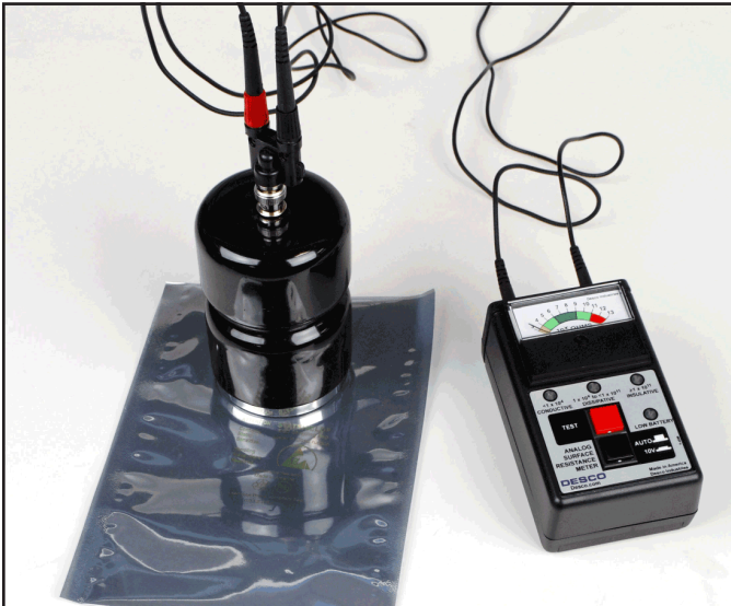
Figure 3. Using the Concentric Ring Probe with the Desco Analog Surface Resistance Meter